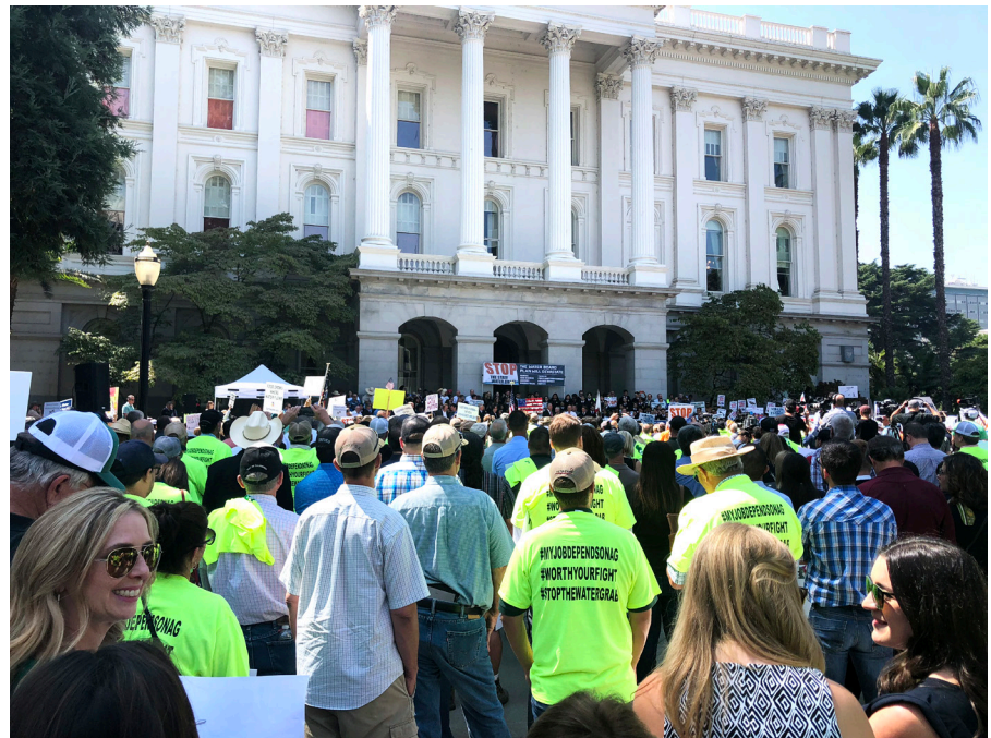
Hundreds, including farmers and community leaders, gather at the State Capitol for the Water Rally held in opposition to the State Water Resources Control Boards Bay Delta Plan.